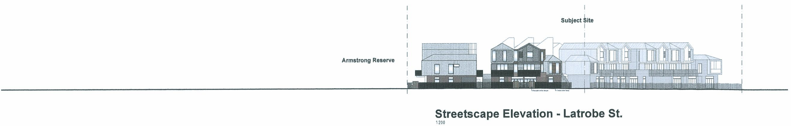
Streetscape Elevation - Latrobe St. 1:200