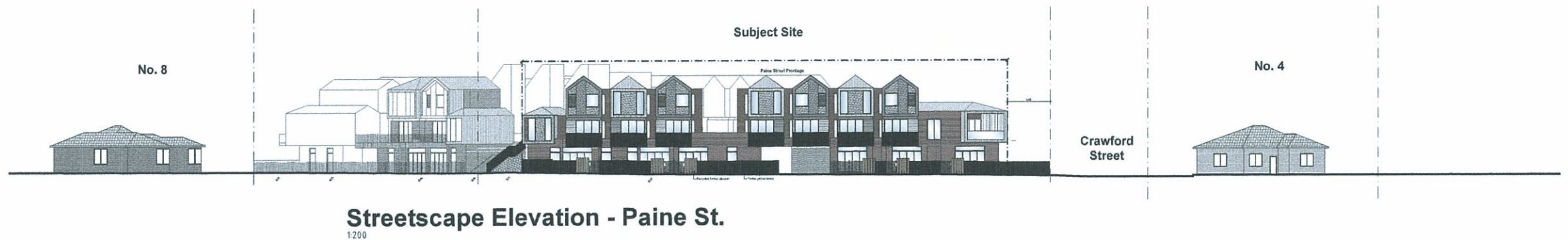
Streetscape Elevation - Paine St. 1:200