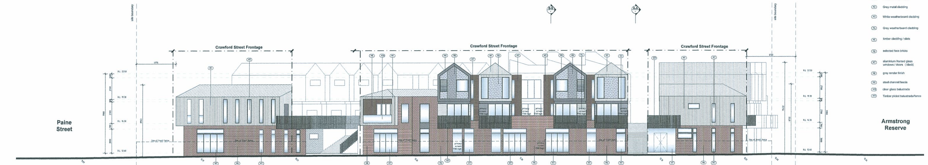
Crawford Street Elevation - North East 1:100