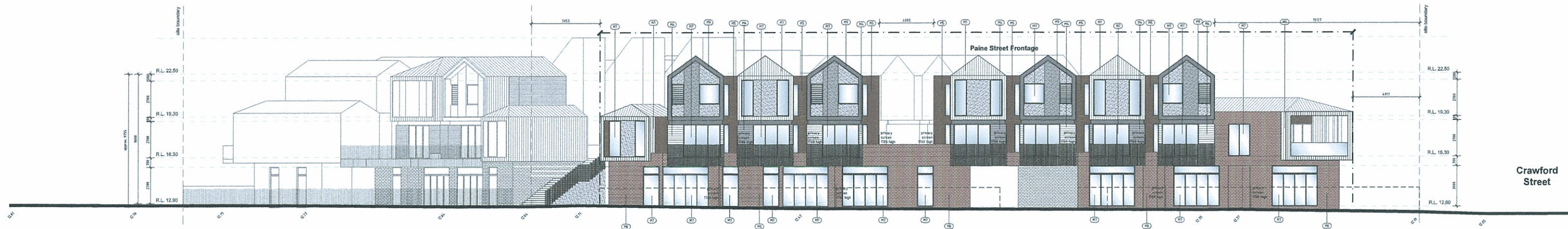
Paine Street Elevation - South 1:100