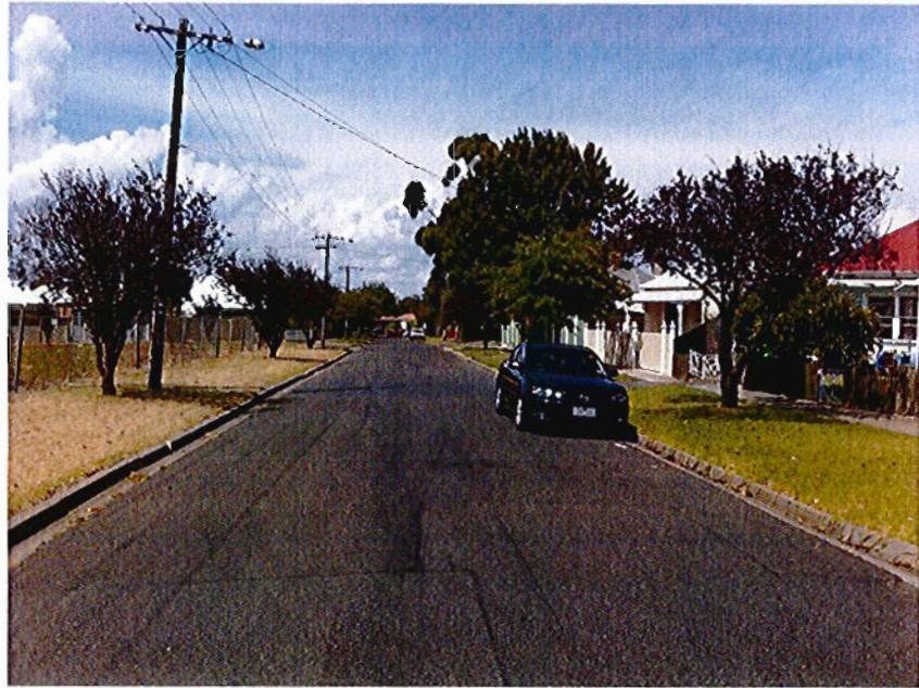
Figure 3 View east along Paine Street from the intersection with Latrobe Street. The development site is at left.