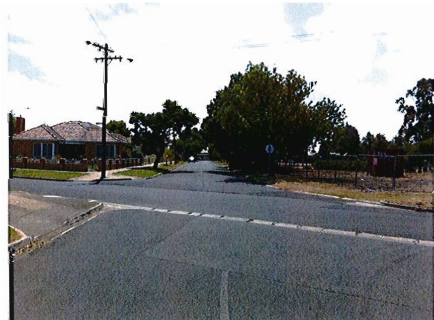
Figure 2 View south along Latrobe Street across the intersection with Paine Street.