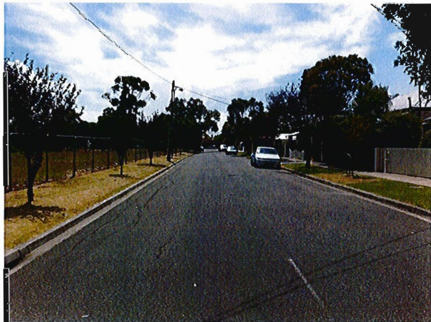
Figure 4 View north along Crawford Street from the intersection with Paine.