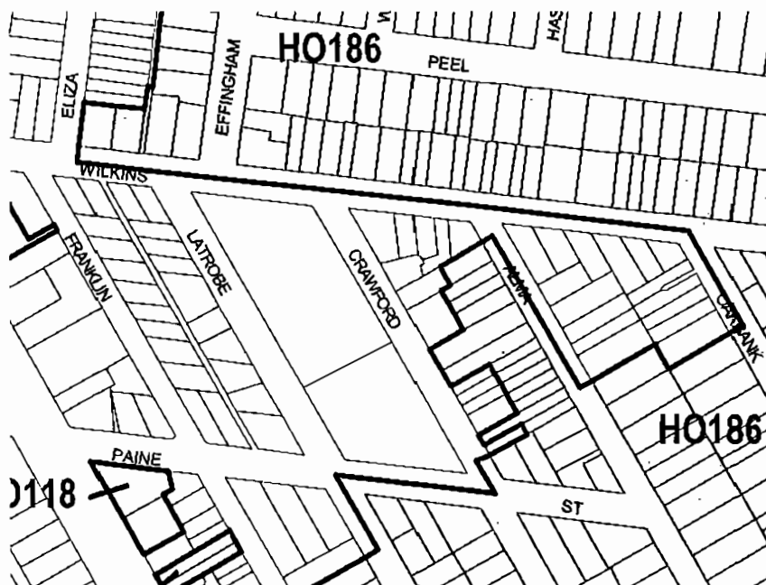
Figure 1 Part Exhibited C34 map HO11, showing environs of the subject site not within the proposed HO186.

It is noted that the subject site and the surrounding streets were not included in a heritage overlay in the exhibited C34 documentation.