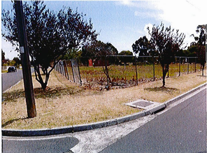
Figure 1 View north across the subject site.